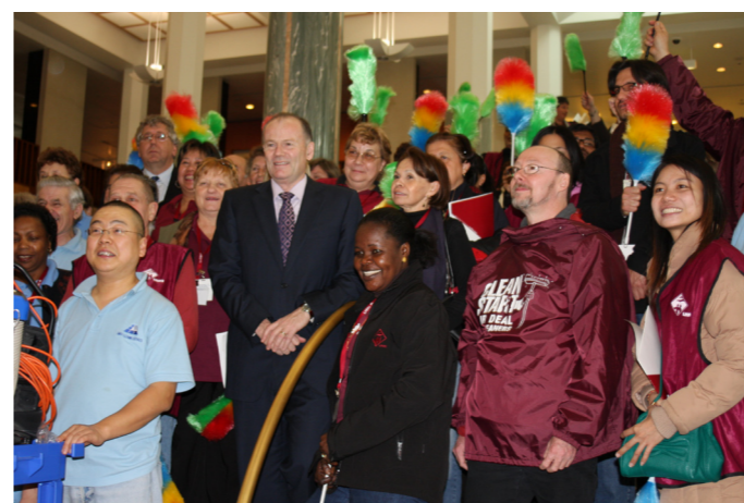
Lindsay Tanner, Minister for Finance and Deregulation (centre), on the steps of Parliament House with LHMU cleaning delegates from around the country, as well as cleaners with their cleaning equipment from Parliament House.

since 2006, and in July 2008 reaffirmed its commitment to reform government cleaning contracts, with Mr Jon Stanhope, Chief Minister, stating in a letter to the LHMU: "Cabinet recently considered a number of measures to reaffirm the Government's commitment to a fair deal for cleaners...the ACT Government is pleased to announce a number of new initiatives to further enhance the conditions and job security applying to cleaners of ACT Government facilities."